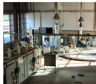
Hot shop at CRISFORM, Marinha Grande

Information and pre-registration: VICARTE www.vicarte.org