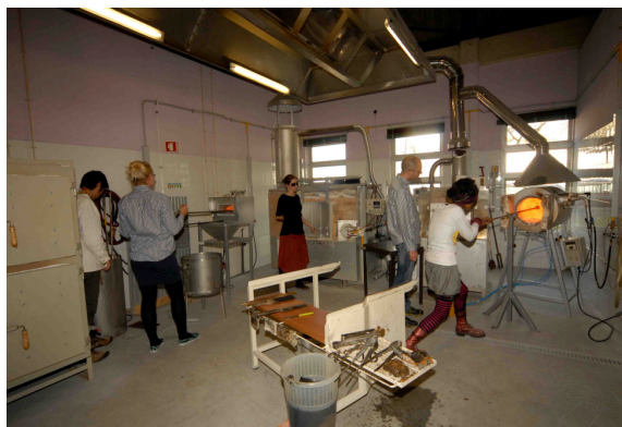
Master students blowing at UNL

In addition to its past and current research activities in all areas at the intersection of art and science, a pursuit in which VICARTE was the pioneer in Portugal, we are now at the end of the first year in which we could offer a very highly innovative post-graduate degree, the first in the world, a Master of Glass Art and Science. This master's degree program officially started in October 2009 and has in its first year of existence, a group of students of highly varied educational background and national origin. Our current group comes from: Canada, Finland, France, Japan, the Netherlands and Portugal.