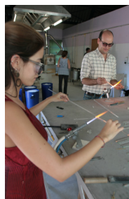
Lampwork bench at UNL

The students following this new Master's degree courses have at their disposal all standard studio glass-working facilities. Our students also have at their disposal some complex and unusual equipment as well. Among these are a CO 2 laser engraver, a 3D printing machine, serigraphy equipment and thin layer deposition equipment. Additionally the students are, twice each year, able to make work using all of the industrial glass facilities at CRISFORM in Marinha Grande, Portugal's industrial glass center. Crisform is a very well equipped institution whose founding purpose was to join individual glass industrial companies in Portugal to provide for them education in the various professional pursuits relevant to industrial glass production.